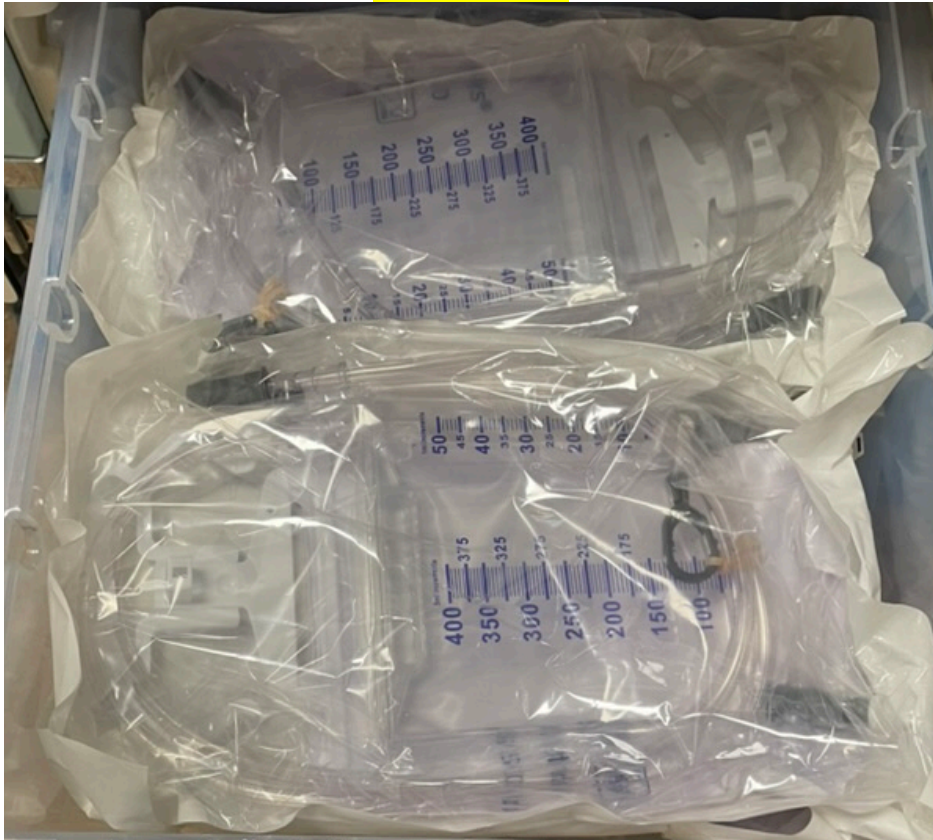
Volumetric hourly urometer reservoir